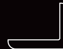
L TRIM PROFILE 25 x 15mm