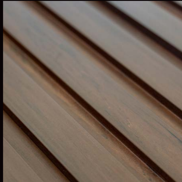
COFFEE - EL1102